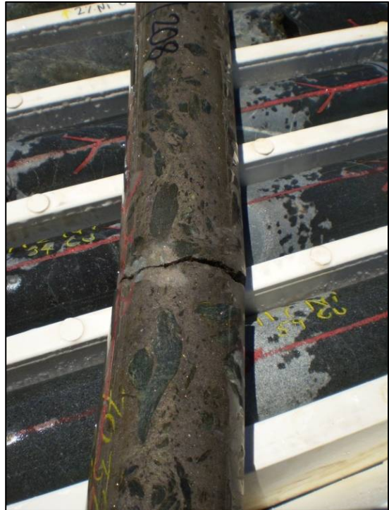
Figure 1: Massive brecciated Ni-Cu-PGE sulphides

TBRC080 intersected massive sulphides which included 4.13m @ 2.06% Ni, 0.22% Cu, 2.78g/t Pt/Pd, 545ppm Co and 0.08 g/t Au from 205.76m including a maximum grade of 4.98% Ni, 6.93 g/t Pt+Pd, 0.25% Cu, 0.21 g/t Au and 1250ppm Co over 0.76m from 207.84m . This hole intersected the nickel mineralisation 25m 'down contact' from TBRC070, which intersected a best interval of 20m @ 1.32 % Ni, 0.23% Cu, 1.54g/t Pt+Pd, 365ppm Co and 0.14 g/t Au from 184m including; 7m @ 2.61% Ni, 0.42% Cu, 3.75g/t Pt+Pd, 686ppm Co and 0.21 g/t Au from 190m.